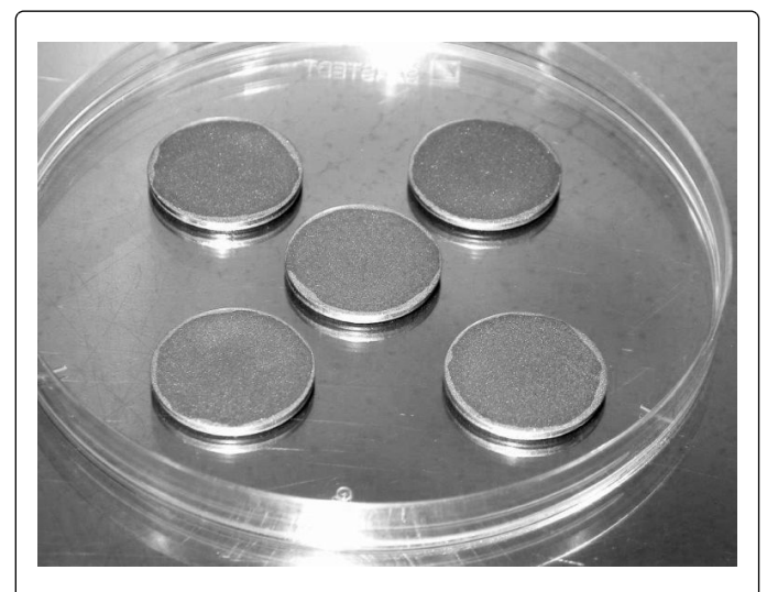
Figure 1: Virus test suspension dried onto test coupons.

In control experiments, the coupons were removed from the instrument before start of the ozone treatment routine. In Polyoma virus, positive virus inactivation controls with formaldehyde were performed. Interference of possible ozone reaction products with susceptibility of the CV 1 cell line was excluded in additional control experiments.