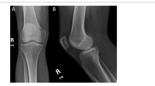
Figure 1: Anteroposterior (A) and lateral (A) right knee radiographs, showing normal radiographic appearance of the right knee

A 54 year-old man presented with a multi-year history of right antero-superior and antero-medial knee pain, primarily described as dull and aching, exacerbated by ambulating down stairs, bending, or twisting, and alleviated by rest. He did not endorse a history of antecedent trauma. Physical examination revealed mild right quadriceps muscle atrophy, and palpation elicited pain localized primarily to the suprapatellar region, but to a lesser degree in the superior aspect of Hoffa's fat pad. Provocative knee maneuvers demonstrated positive Apley compression (suggests meniscal pathology) and patellar grind (suggests patellofemoral syndrome) tests, without evidence of joint instability [1,2]. Three prior intra-articular knee joint injections did not provide symptomatic relief.