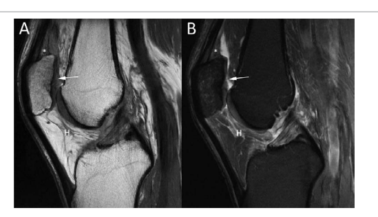
Figure 2: Sagittal proton density (A) and T2 fat saturated (B) images through the right knee obtained by non-contrast 3 Tesla magnetic resonance imaging, demonstrate subtle obscuration of fat (*) on proton density and minimal edema on T2 (*). Hoffa's fat pad (H) is within normal limits. Incidental note is made of mild associated patellofemoral chondrosis (arrows).