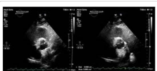
Figure 1: Transthoracic echocardiography showed a large right coronary artery arising from the right sinus of valsalva in the parasternal short axis.

We presented a single coronary artery case with the R-III type which is a very rare type comparing with other types of single coronary artery originating from right sinus valsalva.