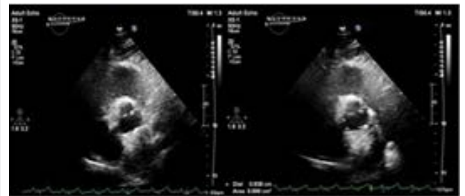
Figure 1: Transthoracic echocardiography showed a large right coronary artery arising from the right sinus of valsalva in the parasternal short axis.

We presented a single coronary artery case with the R-III type which is a very rare type comparing with other types of single coronary artery originating from right sinus valsalva.