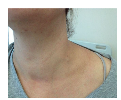
Figure 2: Diagnosis of an enlarged supraclavicular left sided lymph node.

Virchow node (signal node) is a lymph node in the left supraclavicular fossa (the area above the left ventricle). It takes its supply from the lymph vessels in the abdominal cavity [1]. It is named after Rudolf Virchow (1821-1902) a German pathologist who first described the gland and its association with gastric cancer in 1848 [2]. The pathologist Charles Emile Troisier noted in 1889 that other