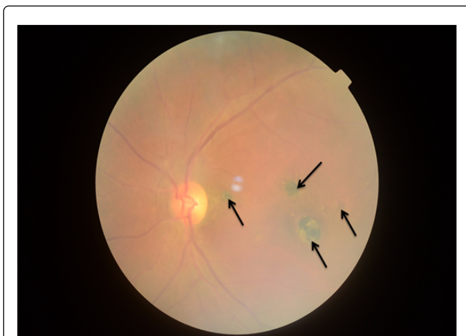
Figure 2: Multiple posterior pole lesions of a 50 year old patient; Size of lesion<1DD; VA=6/36.

Elder patients had larger retinochoroidal lesions: mean age of patients ( 43.7 \pm 13 years) with lesions \geq 2DD was significantly higher than the mean age of patients ( 27.1 \pm 10 years) with smaller lesions <2DD [ F=14.2 , p=0.001 ]. Similarly, multiple lesions occurred significantly ( F=13.4 , p=0.001 ) in elder patients (mean age of 47.4 \pm 11 years) than in younger patients (mean age of 29.4 \pm 12 years).