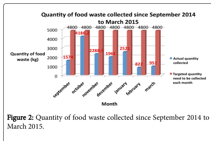
Figure 2: Quantity of food waste collected since September 2014 to March 2015.

Bio-recycling Centre is created to integrate the collection of wastes from various sources, such as food waste, green waste and solid waste, in order to promote the healthy lifestyle and further practicing the entrepreneurial spirit among university's citizen. Through some researches and sustainable practices, the implementation of Sustainable Arcade (Green Cafeteria) and Bio-Recycling Centre in UTM shows some improvement in the waste management since it was implemented on 2010. Through the UTM Campus Sustainability flagship project, a total of 9 researchers have conducted a 7 months research on project title "On-Campus Bio-Recycling Of Food and Green Waste Into Compost" in order to produce a feasibility report on scaling up the bio-composting process and also to scale up the current practice in amount of food waste collection (80 kg/day to 400 kg/day). This ongoing research has become a gateway for UTM functionality as a Living Laboratory towards Zero Waste Society and creating a small scale composting of food and green waste. The quantity of food waste (kg) collected since September 2014 to March 2015 has been recorded and presented in Figure 2. However, this data only represent for 2 sustainable arcades at that time, namely Meranti and Cengal.