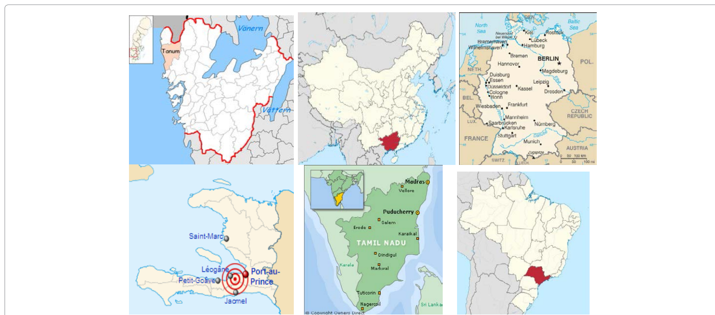
Figure 2: Maps of different regions showing the location of 1.Tanum- Sweden, 2. Guangxi Zhuang Autonomous Region 3. Frankfurt-Germany 4.Haiti earthquake, 5. Tamil Nadu -India and .6. São Paulo-Brazil.

Vastra Gotaland County in western Sweden. is a Scandinavian country in Northern Europe. Its seat is located in the town of Tanumshede, with 1,600 inhabitants. in Sweden has introduced urine separation toilets to recover phosphorus.