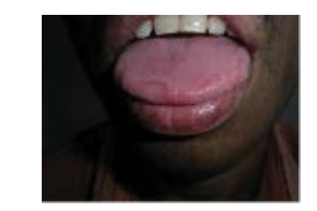
Figure 5: Depapillated areas with whitish circinate borders, suggestive of geographic tongue.

of light sources in the dental office, including overhead lights, view boxes, dental lamps, fiber optic lights, computer screens and dental curing units. If the UV light meter shows a reading above 0 \text{ nm/cm}^2 for UV light, the use of that unit should be contraindicated.