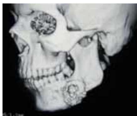
Figure 2b: 3D construction CT image: Lateral aspect of the lesion.