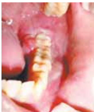
Figure 1b: Intraoral photograph: A swelling causing obliteration of the buccal vestibule.

Based upon the clinical and radiological findings, a provisional diagnosis of malignancy of left body of mandible was given. The differential diagnosis included central vascular lesion (hemangioma), cellulitis involving left buccal, vestibular and submandibular space. The non-contrast multislice spiral CT scan of the mandible and face revealed expansile destructive complex mass lesion involving the body and ramus of left side of mandible with hypodense to cystic component surrounding it (Figures 2b). Incisional biopsy revealed proliferation of spindle shaped anaplastic fibroblasts and osteoblasts