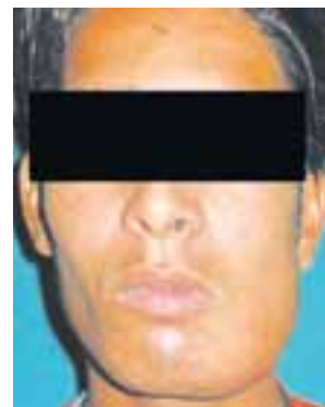
Figure 1a: Extraoral photograph: A diffuse swelling over left body and ramus of the mandible.

The radiographic evaluation included the intraoral periapical radiograph (IOPA), and panoramic radiograph. The IOPA revealed a widening of the periodontal ligament space (WPLS) with an irregular absence or attenuation of the lamina dura i.r.t. 36, 37, 38. Panoramic radiograph revealed an ill defined, mixed radiolucent-radiopaque lesion along the left body of mandible, denoting irregular areas of osteolysis. The mandibular cross-sectional radiograph showed the