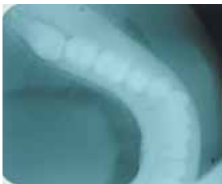
Figure 2a: The mandibular occlusal radiograph: Radial spicules spreading outside the jaw bone on left side, giving a “sunburst appearance”.