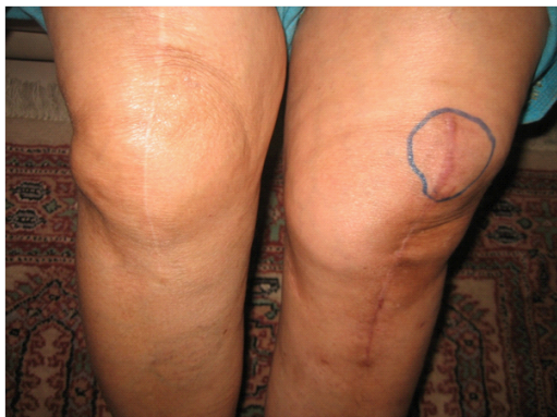
Figure 1: Patella has been displaced upward and associated with swelling and painful restriction of movements.