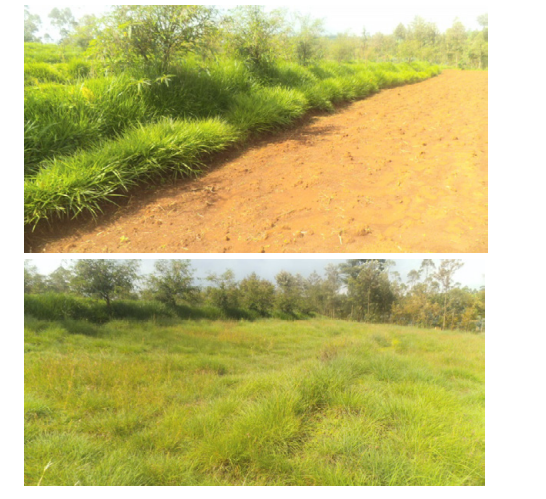
Figure 4: Improved forages at Farmers Training Center (FTC) at Hoda, Kachabira district.

zone. The woreda lies between 07°12′30.1"-07° 17′ 08.3N and 37° 47′48- 37° 50′ 30.6E with an altitude of 2400 meters above sea level. Kacha Bira is bordered on the south by an exclave of the Hadiya Zone, on the southwest by the Wolayita Zone, on the west by Hadero Tunto, on the northwest by the Hadiya Zone, on the north by Doyogena and Angacha, and on the east by Kedida Gamela. Kacha Bira has 56 kilometers of all-weather roads and 37 kilometers of dry-weather