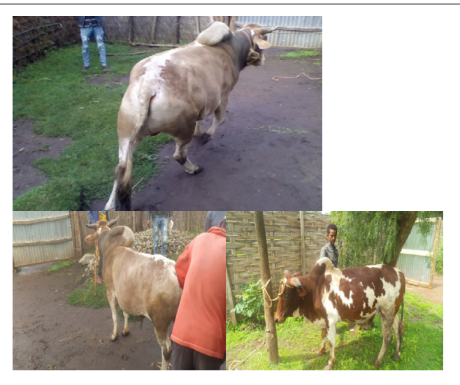
Figure 3: Fattened animals ready for market.

zone. The woreda lies between 07°12′30.1"-07° 17′ 08.3N and 37° 47′48- 37° 50′ 30.6E with an altitude of 2400 meters above sea level. Kacha Bira is bordered on the south by an exclave of the Hadiya Zone, on the southwest by the Wolayita Zone, on the west by Hadero Tunto, on the northwest by the Hadiya Zone, on the north by Doyogena and Angacha, and on the east by Kedida Gamela. Kacha Bira has 56 kilometers of all-weather roads and 37 kilometers of dry-weather