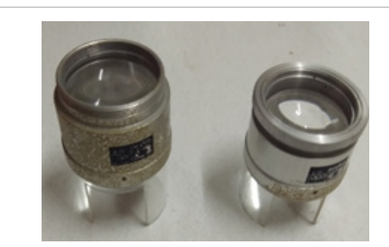
Figure 7: Stand magnifier used for near reading in eccentric fixation.