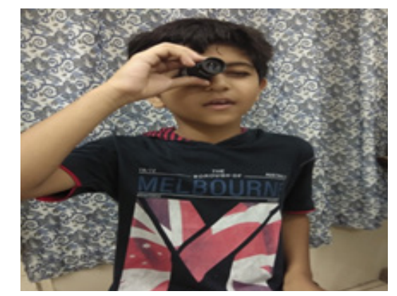
Figure 2: Child using telescope for distance viewing (Black Board).