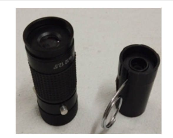
Figure 1: Telescopes for distance viewing.