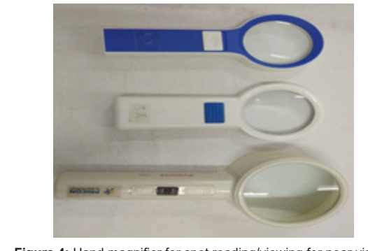
Figure 4: Hand magnifier for spot reading/viewing for near vision.