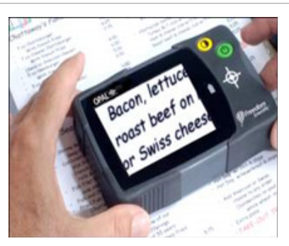
Figure 9: Electronic hand held video magnifier.