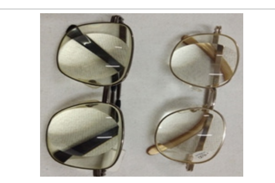
Figure 6 : Spectacle magnifier for reading any text for longer duration.