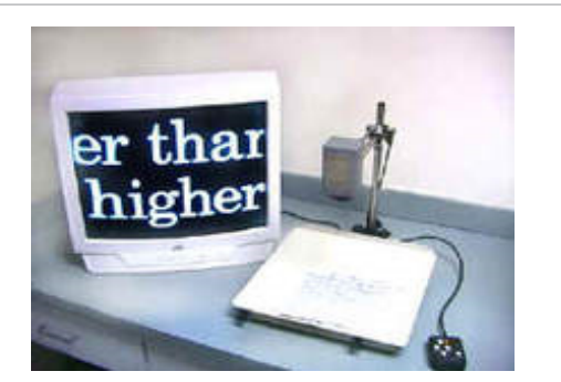
Figure 8: Electronic CCTV mouse camera attached to TV/computer.