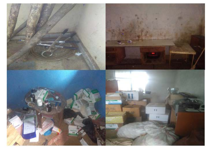
Figure 5: Drug stores and clinic rooms.