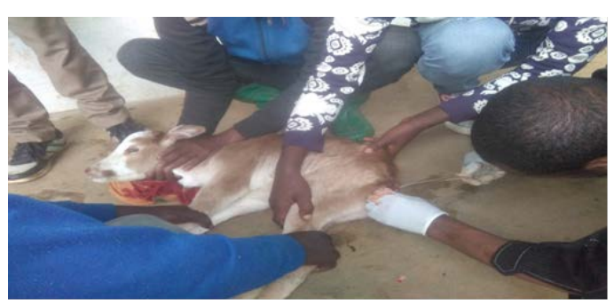
Figure 3: Surgical procedures performed in the district.