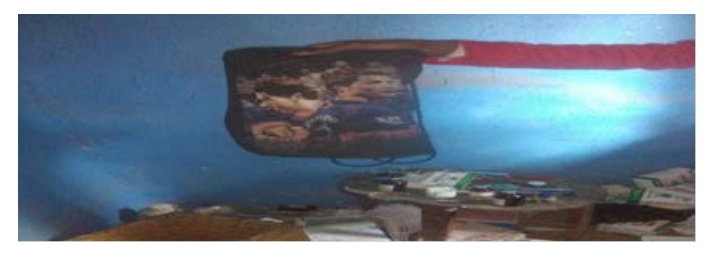
Figure 4: A bag that was used for carrying drugs.