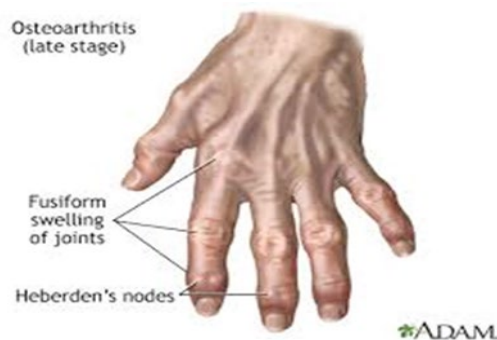
Figure 1: Arthritis Symptoms.

Rheumatoid arthritis may be tough to diagnose in its early levels