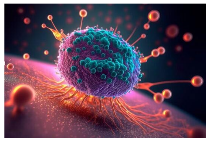
Figure 2: Malignant cells grow in an uncontrolled way.

A major finding of the program was that compounds with similar patterns of cell line chemo-sensitivity tend to have common mechanism of action, which led to the development of new algorithms for data analysis and adaption of study designs [14]. The NCI60 anticancer drug discovery program was reviewed in detail by Shoemaker, who highlighted its history and methodology. Learning from the NCI60 experiences, the Cancer Chemotherapy Centre of the Japanese Foundation for Cancer Research established the JFCR-39 platform. This panel of 39 human tumour-derived cell lines included a subset of the NCI60 cell lines and additional gastric cancer cell lines. A new