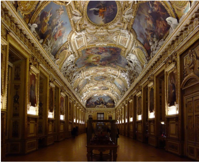
Figure 2: The Louvre- interiors.

American arts offer a global perspective. Delve into the intricate beauty of Persian carpets, immerse yourself in the symbolism of Chinese calligraphy, and appreciate the spiritual grace of African masks—each artifact tells a unique tale of human creativity and resilience (Figure 2).