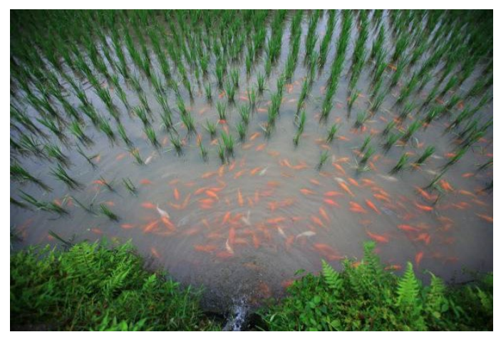
Figure 2: Fish, soil, and the battle against methane in rice-fish cultivation.