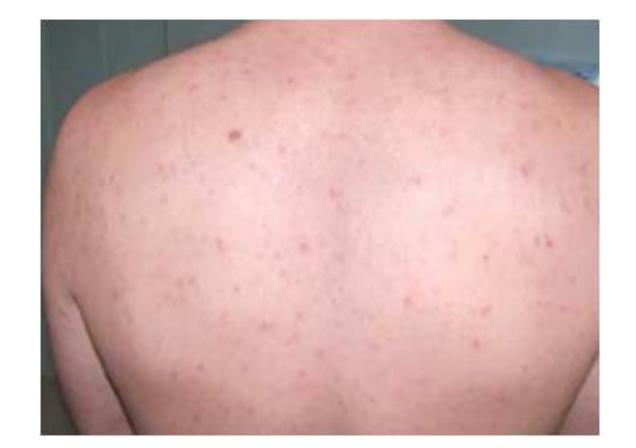
Figure 1a: Generalized maculo-papular skin rash in a patient with Mediterranean spotted fever

Rickettsial agents are classified into three major categories: the spotted fever group, the typhus group, and the scrub typhus [1,2]. The