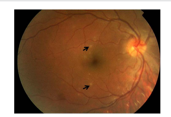
Figure 2a: Fundus photograph of the right eye shows multiple small retinal white lesions consistent with inner retinitis (arrows) in a 19-year old patient with Mediterranean spotted fever, and no ocular complaints.