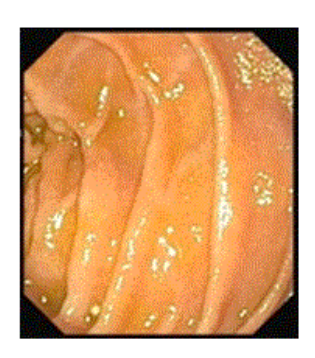
Figure 1: Second portion of the duodenum with discrete attenuation of villous pattern on upper endoscopy.

Upper endoscopy evidenced a discrete attenuation of duodenal villous pattern without other findings (Figure 1). Histopathological examination of duodenal biopsies showed near total villous atrophy, increased intraepithelial lymphocytes and lymphocytic infiltration in the lamina propria (Figure 2). These findings were consistent with celiac disease.