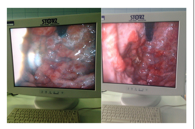
Figure 2: Images of stomach fundus after one month of treatment.

Our patient was treated initially with frequent albumin infusions (every two or three days) for three weeks. She was treated also with lasix and esomeprasole (1 mg/kg/day). We have started a high protein diet. She continues to have abdominal pain and vomiting but all symptoms are resolved within a month. A month later the last laboratory data showed a normal level of albumin in blood and the control of upper endoscopy showed an important amelioration (Figure 2).