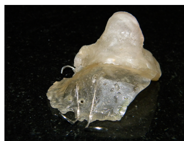
Figure 6: Closed hollow bulb interim obturator.