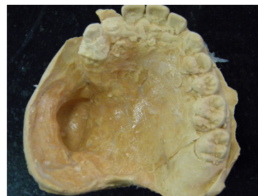
Figure 5: Clear acrylic resin adapted on defect site.