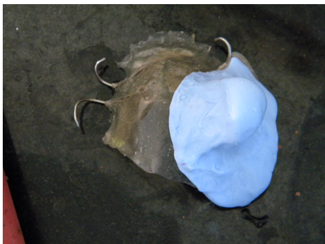
Figure 2: Putty impression of the defect site in surgical obturator.

tissues to maintain facial esthetics [5]. Weight of denture and gravity would affect the retention of maxillary denture [6] and hence closed hollow bulb obturator mentioned in this article would be time effective, simple in fabrication and less traumatic technique.