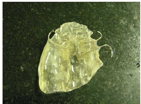
Figure 1: Surgical obturator.

the maxillary arch (Figure 2). Pick up the obturator from the maxillary arch using alginate impression on a perforated stock tray (Figure 3). Apply vaseline over the tissue surface of obturator and pour the cast. Remove the Surgical obturator and paint separating medium on the cast (Figure 4). Adapt the autopolymerising clear acrylic resin on the depth and borders of the defect only, creating a hollow bulb (Figure 5) and place back the surgical obturator on the cast in its previous position. Once set, closed hollow bulb and the plate comes as one unit (Figure 6). Finish, polish and insert the closed hollow interim obturator.