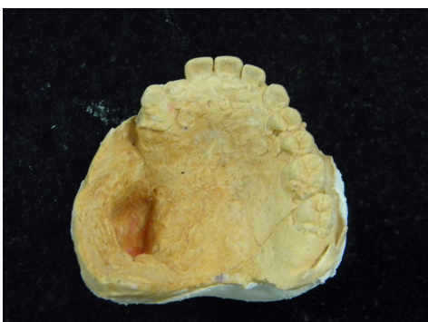
Figure 4: Final cast.