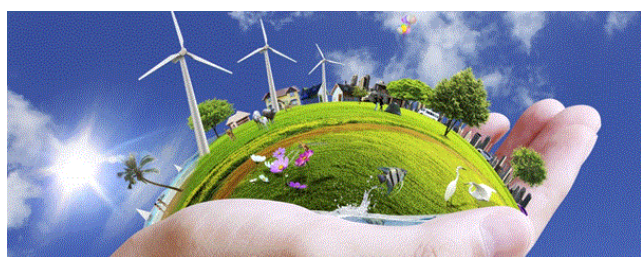
Figure 1: Renewable energy outlook [8].

Today, Earth's population stands at more than seven billions [1]. Along with a constantly growing human population, the living standards are also increasing. Energy is the initial driving force for achieving advancement in human living [2]. As a result of that, the worldwide energy consumption is expected to double within the next 35 years [3]. Fossil fuels such as coal, oil and natural gas have generated most of the energy consumed globally for over a century [4]. But fossil fuels are responsible for a significant amount of land, water and air pollution beyond their carbon dioxide production [5]. Due to large production of carbon dioxide from energy generation, along with emission from vehicles, the earth temperature rises by approximately 2-3°C and it is expected that the same will go up further [1]. This may result into geographical as well as environmental imbalance. To solve these problems, there has been recently a trend towards the increase in the utilization of various renewable energy resources [4]. In this respect, wind power, solar energy, hydrogen geothermal energy, biomass and bio-fuels are extensively investigated for a few decades both from the scientific/academic and industrial/societal viewpoints [6,7].