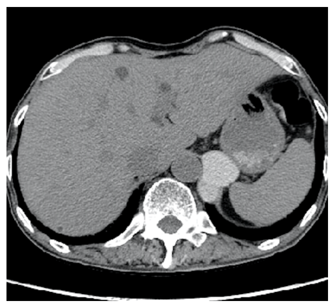
Figure 1: Chest computed tomography revealed a boundary clear cystic lesion in the left diaphragm.

A 68-year-old man who suffered from pharyngeal cancer had treatment histories including initial operation, subsequently radiotherapy, and chemotherapy over the previous 2 years. He had ceased treatment for cancer because of deterioration of his systemic condition. He was hospitalized frequently due to gastrostomy problems and pneumonia. When hospitalized with pneumonia, chest computed tomography (CT) revealed a boundary clear cystic lesion in his left diaphragm, which was considered to be a benign tumor based on the contrast pattern, and not metastasis of pharyngeal cancer (Figure 1). He died due to worsening of his underlying illness and pneumonia. An autopsy was performed and a cystic lesion was detected in the diaphragm. The pathological findings revealed linear cystic lesions with cuboid or pili-bearing columnar epithelium (Figure 2A and 2B), which were positive for thyroid transcription factor-1 (TTF-1) on immunohistological staining (Figure 2C). These findings confirmed the diagnosis of intradiaphragmatic bronchogenic cyst [1-3].