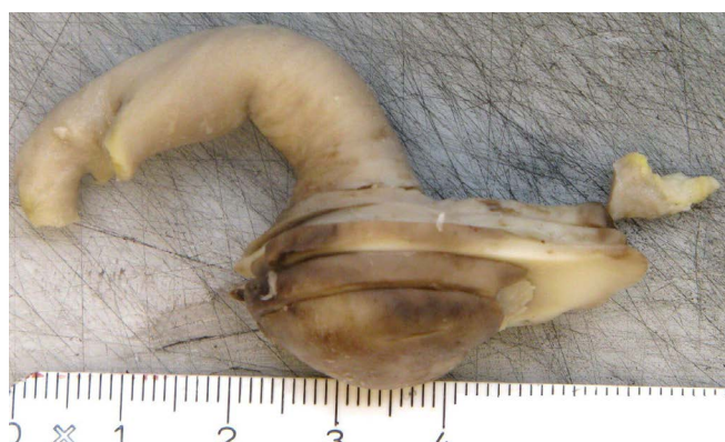
Figure 3: Pathology examination revealed branching Y-shaped and 90 degree angle fungus hyphen suspected for angioinvasive fungus.

structures [1-3]. Mucormycosis causes an acute angioinvasive infection primarily in immunocompromised patients [3].