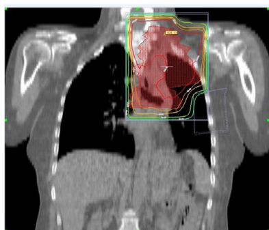
Figure 3: A coronal section of the post-operative external beam radiotherapy plan.

sub carinal, left mediastinal, and left supraclavicular lymph nodes. An FDG avid soft tissue density inside the right breast was also evident. No other metastatic sites were indicated. The tumor was clinically staged as T2aN3M1b (Stage IV).