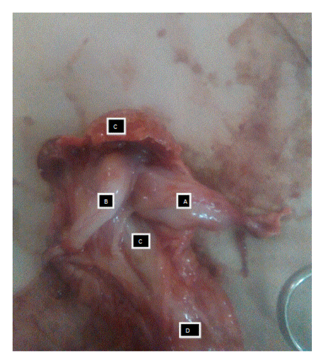
Figure 1: Duplex appendix (A and B), C-cecum, D-ascending colon.