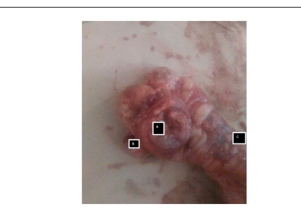
Figure 3: Resected bowel segment (luminal surface), A- Cecal opening of ileum, B-appendix-areas of gangrenous Cecal wall.