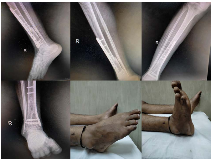
Figure 4: Images of 7 month follow up, demonstrating excellent recovery.

was 57.53 min and the average duration of surgery in plating group was 69.33 min which was comparable to the studies done by Guo JJ, et al. [18]. In present study, fracture of fibula was seen in 7 cases in