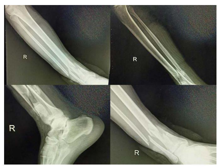
Figure 2: Radiographic images showing distal tibia fracture.

the hopes of decreasing the complications resulting from treatment [14,15]. With the development of minimally invasive surgery, percutaneous plating has challenged interlocking nailing as locked plate designs act as fixed-angle devices whose stability is provided by the axial and angular stability at the screw-plate interface instead of relying on the frictional force between the plate and bone, which is thought to preserve the periosteal blood supply around the fracture site [16,17]. In present series, 48 cases of extrarticular distal tibia fractures were treated primarily over a period of two years with follow up ranging from 12 months to 22 months. We evaluated our results and compared them with the result of various studies in the literature. In present study, the average duration of surgery in interlocking group