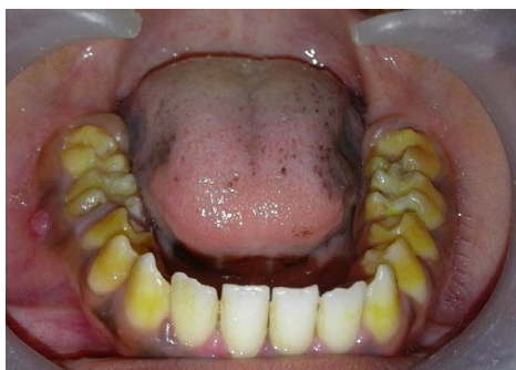
Figure 1b: Mandibular arch demonstrating sparing of the incisors.