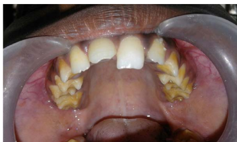
Figure 1a: Maxillary arch demonstrating sparing of incisors.