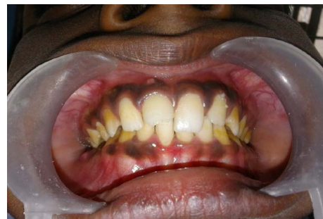
Figure 1: Yellowish brown discoloration of teeth seen in all quadrants from permanent canines to second molars.

surfaces of the teeth and the middle third of the buccal surfaces; however, this discoloration did not involve the cervical third of the teeth. The surfaces of the teeth were rough, but the shape and size of the teeth appeared to be normal. On palpation, no softness or chipping of enamel was noted. None of the usual complications of amelogenesis imperfecta, viz. sensitivity, anterior open bite, attrition of teeth were present in this patient. Large carious lesions were seen in the occlusal surfaces of the left and right mandibular permanent first molars, with a sinus tract opening into the attached gingiva in relation to lower right first permanent molar. On examination of the periodontium, generalized plaque and calculus accumulation was seen, with a generalized chronic gingivitis. The striking feature was that the upper and lower central and lateral incisors on both arches seemed to be completely spared of the affliction (Figures 1A and 1B). These teeth had a normal appearance without any discoloration except for a fracture in the right maxillary central incisor involving the enamel and dentin (Figure 1A). An orthopantomogram revealed thin caps of enamel present on the posterior teeth with snowcapped appearance