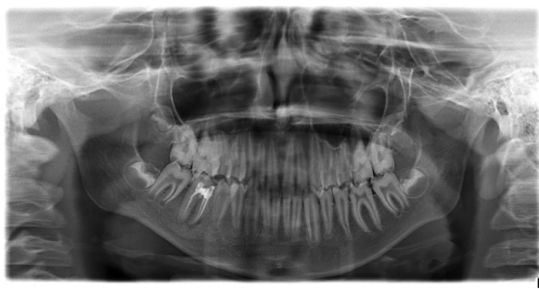
Figure 2: Orthopantomogram showing thin, poorly mineralized enamel over the cusps of the posterior teeth giving them a snow capped appearance.

of the posterior teeth (Figure 2). Based on the history, the clinical features, and the radiographic findings, a provisional diagnosis of amelogenesis imperfecta was made with chronic apical periodontitis in the lower right and left first permanent molars. As to the type of AI, it was postulated that this case was a combination of the hypomaturative and the hypocalcified patterns. A treatment plan consisting of oral prophylaxis, endodontic management of lower first permanent molars and composite restoration of the fractured central incisor was framed. After the completion of endodontic treatment (Figure 3), stainless steel crowns were placed on the lower right and left first permanent molars. Follow up after 2 weeks revealed healing of the sinus tract which was associated with the lower right first permanent molar (Figure 4). The patient was advised to report for placement of full crown restorations in the other posterior teeth.