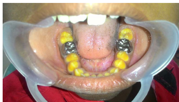
Figure 4: Post-operative photograph taken 2 weeks after endodontic treatment and restoration with stainless steel crowns, with complete healing of sinus tract.