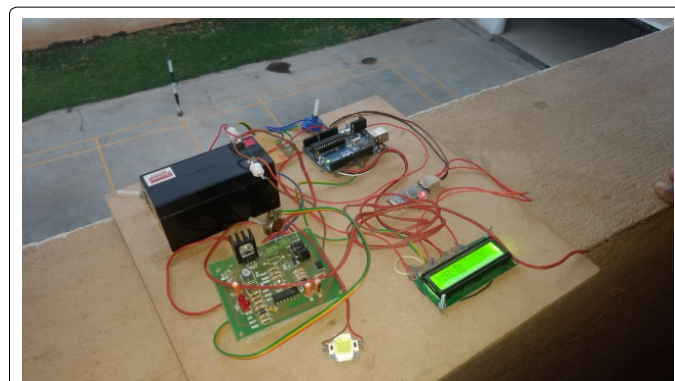
Figure 3: Working circuit results are displayed on LCD.

The charger charges battery up to 12.9 volt and then it charges very slowly. If the battery is fully charged the Optocoupler senses, it and cut off the supply. Input voltage and Battery voltages are compared by comparators (Figure 2) [1-5].