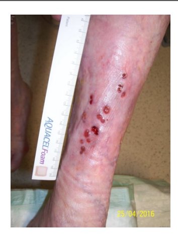
Figure 1: Small fibrinous ulcerations surrounded by erythema left pretibial.

Findings didn't show any evidence of an acute coronary syndrome in the emergency room. The echocardiography revealed left ventricular hypertrophy with normal systolic LV function (ejection fraction 55%) and calcification of aortic and mitral valves. Doppler sonography revealed mean gradient of 67 mmHg on the aortic valve corresponding to sever aortic stenosis (Figure 2). The gradient on the mitral valve was normal.