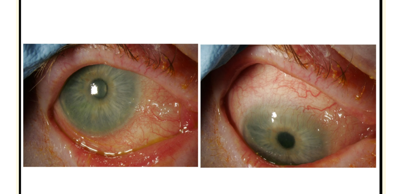
Figure 1: Right eye.

(Figures 1 and 2), her visual acuity was 6/6 in both eyes, with IOP of 20 mmHg in both eyes and 0.9 cupping.