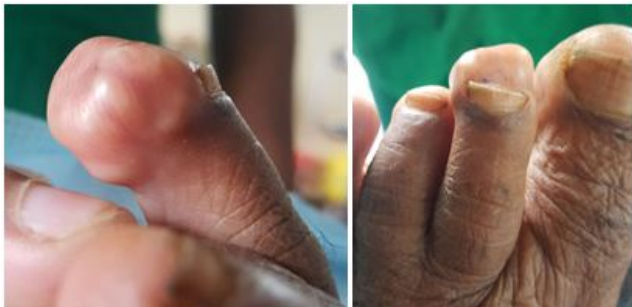
Figure 1: Local examination (left 2 nd toe).

Figure 2 shows expansile chondroid matrix lesion involving the distal phalanx of the second toe not involving the articular surface and no soft tissue infiltration.