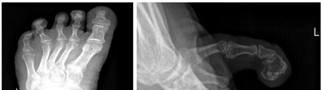
Figure 2: X-ray 2nd toe AP/Lateral.

Figure 2 shows expansile chondroid matrix lesion involving the distal phalanx of the second toe not involving the articular surface and no soft tissue infiltration.