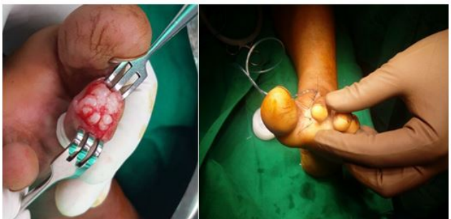
Figure 3: Plan.