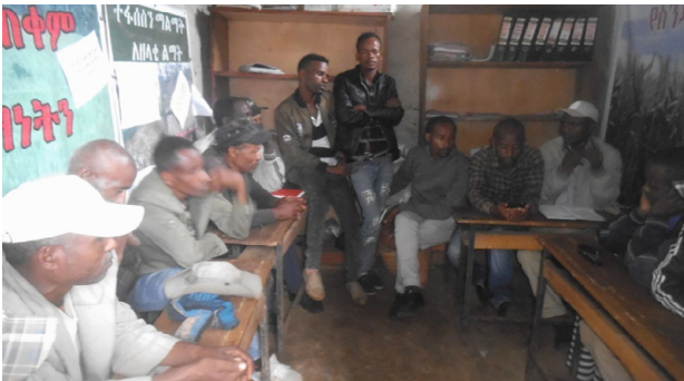
Figure 2: Discussions with farmers who participated in fattening in Hodakebele, Kachabiraworeda.