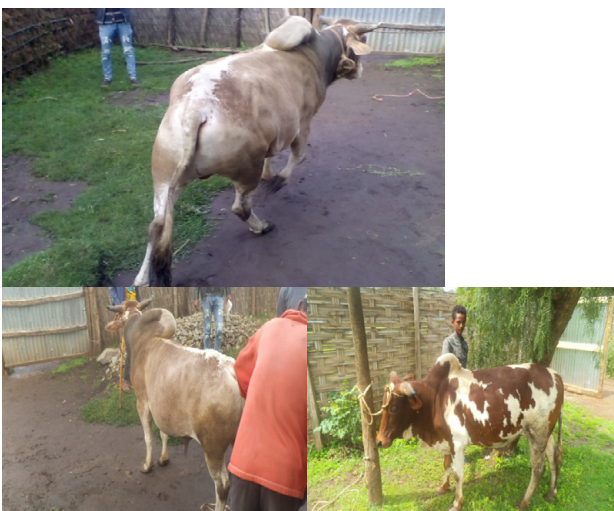
Figure 3: Fattened animals ready for market.

zone. The woreda lies between 07^{\circ}12'30.1'' - 07^{\circ}17'08.3'' N and 37^{\circ}47'48'' - 37^{\circ}50'30.6'' E with an altitude of 2400 meters above sea level. Kacha Bira is bordered on the south by an exclave of the Hadiya Zone, on the southwest by the Wolayita Zone, on the west by Hadero Tunto, on the northwest by the Hadiya Zone, on the north by Doyogena and Angacha, and on the east by Kedida Gamela. Kacha Bira has 56 kilometers of all-weather roads and 37 kilometers of dry-weather