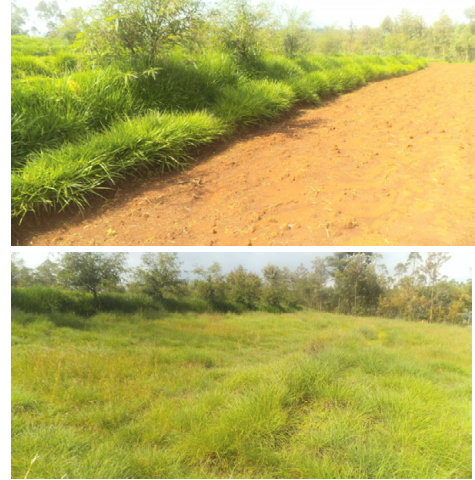
Figure 4: Improved forages at Farmers Training Center (FTC) at Hoda, Kachabira district.

zone. The woreda lies between 07^{\circ}12'30.1'' - 07^{\circ}17'08.3'' N and 37^{\circ}47'48'' - 37^{\circ}50'30.6'' E with an altitude of 2400 meters above sea level. Kacha Bira is bordered on the south by an exclave of the Hadiya Zone, on the southwest by the Wolayita Zone, on the west by Hadero Tunto, on the northwest by the Hadiya Zone, on the north by Doyogena and Angacha, and on the east by Kedida Gamela. Kacha Bira has 56 kilometers of all-weather roads and 37 kilometers of dry-weather