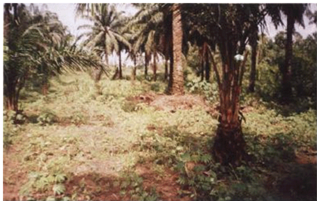
Plate 2: A section of survey block II disturbed by farming activities.

protective clothing worn to protect the skin against thorns, scratches and bites of the thick forest. A compass was employed for location specificity. The animals were identified using a field guide of African mammals by Booth [13], De Blase and Martin [14] and Theodore and Helmut [15].