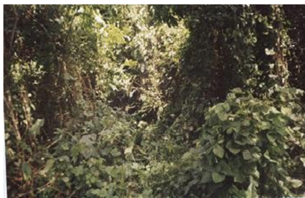
Plate 1: An undisturbed section of the study area (most large mammals inhabit this section BlockI).

Following the necessity to obtain reliable ecological information of the mammalian diversity within this area, we embarked on a six-month surveillance study lasting from February to July 2009. Procedures employed included host community consultation in addition to a simplified sweep survey of the area. The Ethiope Eastern boundaries were divided into three survey blocks; I – North (Obiaruku) (Plate 1) II Central (Abraka), III – South (Eku) (Plate 2). Contact visit expeditions were carried out including interviews with experienced, retired hunters as well as village heads. Bush meat markets were visited as well as contacts with sales men. In this way, vital information on both past and present ecological and population fauna status in the area was assessed.