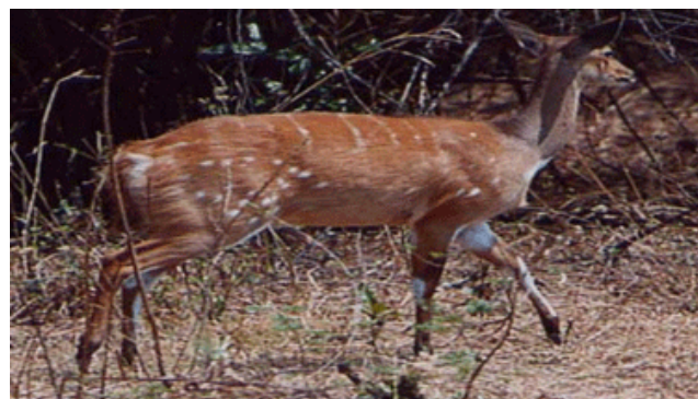
Plate 5: Bush buck Tragelaphus scriptus (sighted in the study area).