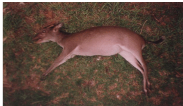
Plate 3: Maxwell's Duiker Cephalophus maxwelli photographed from hunters bag.

All population counts were done by indirect assessments as it is often impossible to obtain accurate, visual or auditory counts of the animals in a population, hence in this study, we used indirect signs of the animals present as indices of relative abundance. Sample counts were made, and the results extrapolated to other areas of similar vegetation type within the survey block. The standard King's Strip Census (KSC) was employed.