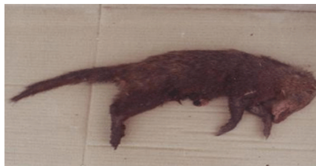
Plate 4: A Cusimanse mongoose Crossarchus obscurus from the hunters bag, shot by a hunters gun.