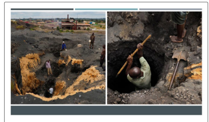
Figure 3: Illegal mining at Black Mountain.

Many residents in desperate need of income, up to now illegally mine the black mountain without professional tools, protective outfit and usually barefooted, as depicted in Figure 3. Artisanal miners sell the salvaged lead metal to the nearby Chinese Company, SuperDeal Investment Limited, which runs a furnace to process manganese ore (editor) [23]. The recovered metal at such a high risk fetches a meager US$0.25 for 25kg of zinc compared with $1.25 for the same quantity of coal (The New Humanitarian). Even worse, youths with little employment alternatives are also engaged in this activity to eke out a living or support their families with little or no income.