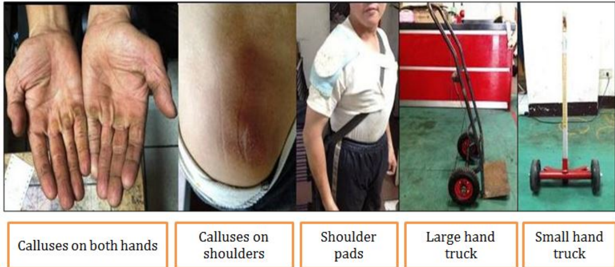
Figure 2: Pictures illustrating points addressed in the in-depth interview.

delivery to the fourth floor or above was requested. This stress was less serious when they were young, but grew with age.