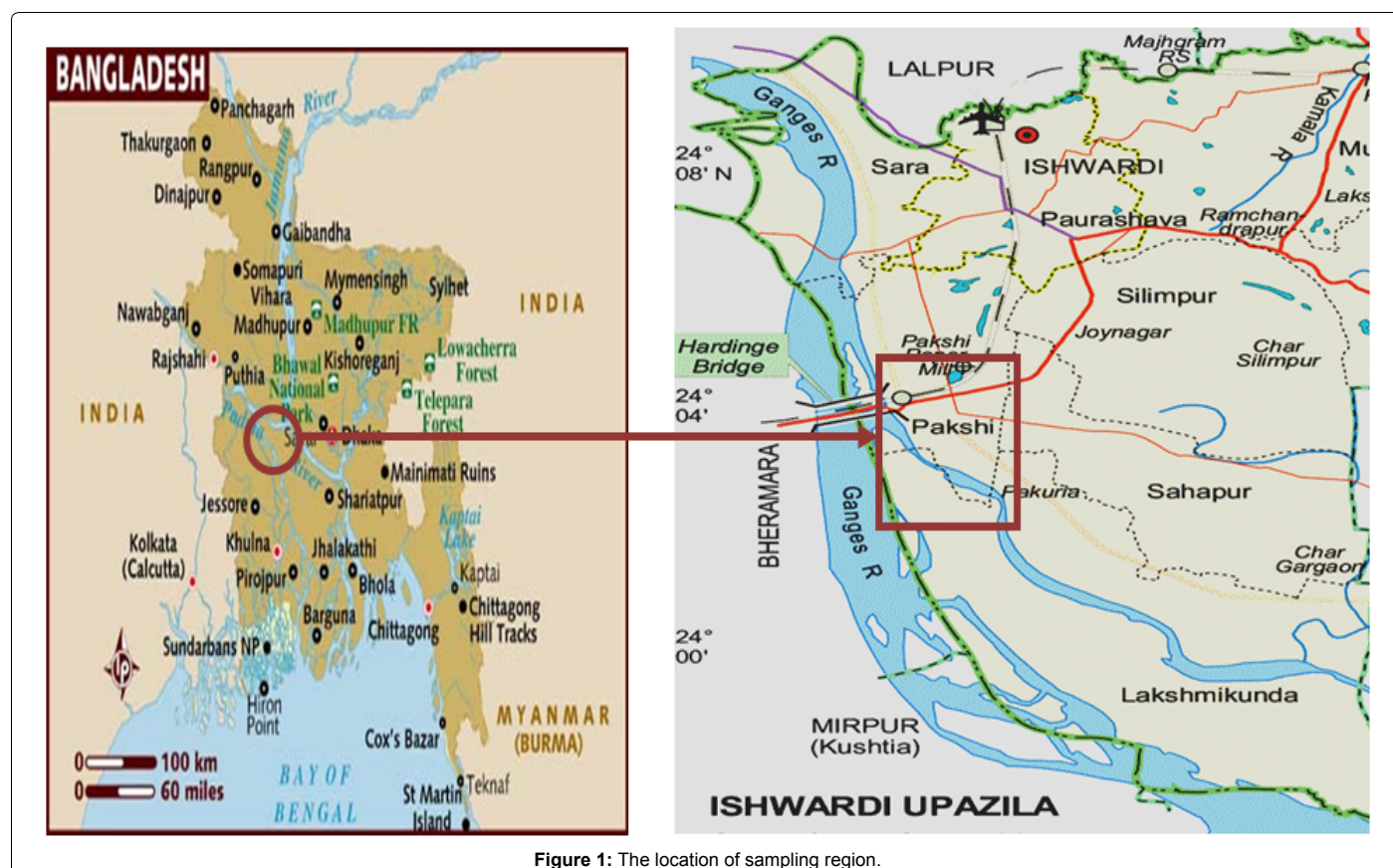
Figure 1: The location of sampling region.