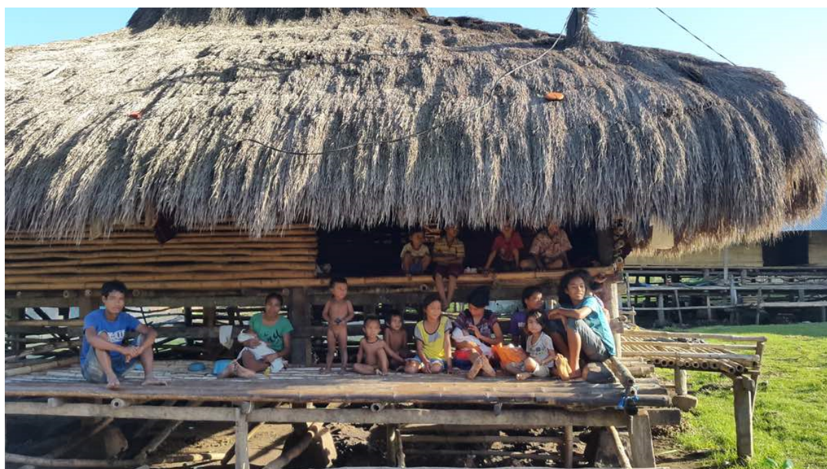
Figure 1: Traditional houses of Southwest Sumba usually consist of three stories: livestock pen, main floor, and storage tower.

Perobatang Village, Southwest Sumba lies on tropical coastline of Indonesia with low rainfall rate and groundwater is hardly accessible without artesian well. To address this issue, the government made several wells however the number was insufficient to fulfill the needs of the villagers. These wells are located far from residential areas, around two to three kilometers. As many of them are poor, vehicles are mainly motorcycles for working purposes. Hence, villagers must walk to these wells to obtain clean water. Due to these reasons, people rarely wash their hands before meals and only bath once a week in these public wells. Water obtained from the wells is used for drinking and cooking purposes. There is no latrine available thus practice of open defecation is a common sight and they had no habit to wash their hands. This poor condition is a suitable breeding site for rodents and insects (Figure 1).