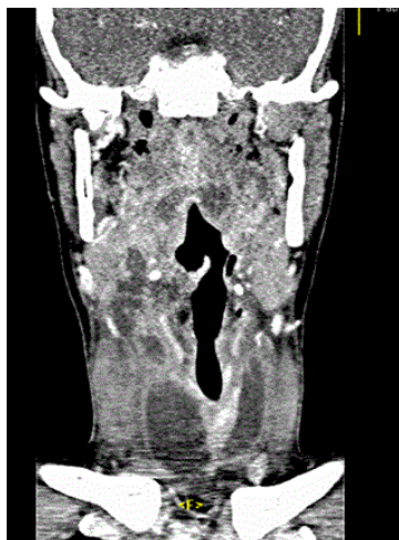
Figure 2: Reconstruction on coronal plane: Demonstrates hypodense areas in retropharyngeal, parapharyngeal and visceral spaces.