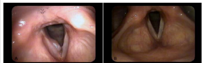
Figure 1: (A) Videostroboscopy showing a cystic lesion involving the inferior edge of the middle third of the right TVC with subglottic extension. (B) Follow up after surgical removal, showing no recurrence.

We report the case of a 23-year-old female patient who presented with fluctuating hoarseness and laryngeal reflux and who was subsequently found to have an ALK-positive laryngeal IMFT. While laryngeal IMFTs are rare neoplasms, it is important to recognize them