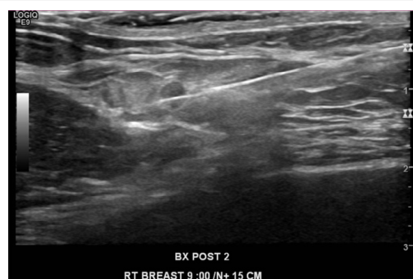
Figure 3: An ultrasound guided biopsy was performed of the suspicious mammographic and sonographic mass, with pathologic concordant diagnosis of metastatic leiomyosarcoma.