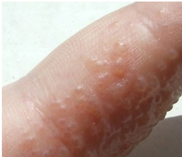
Figure 5: Burn injury on sole.