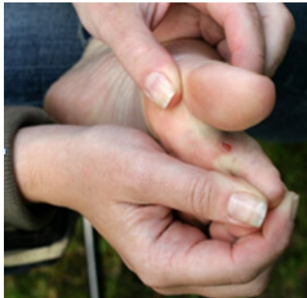
Figure 3: Blisters due to cold bite.