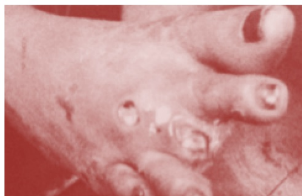
Figure 6: Rodent bite.