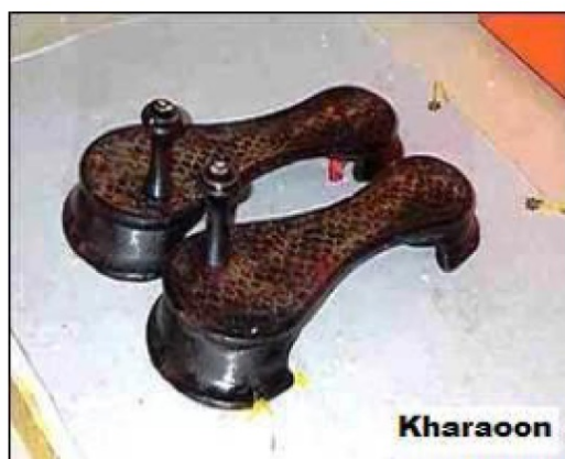
Figure 7: Kharaoon.