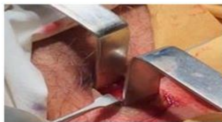
Figure 1B: Underlying platysma and the strap muscles blunt dissected vertically.

After skin division, underlying platysma and the strap muscles blunt dissected vertically by Mosquito hemostats and laterally retracted by the Senn-Miller retractors (Figure 1B).