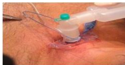
Figure 1D: Insertion of tracheostomic tube.

A cricoid hook is used to provide trachea upward traction for improving exposure. Once hemostasis and exposure are optimized, the second-third tracheal rings is incised vertically with a scalpel and tracheal entrance dilated by Trousseau tracheal dilator. Tracheostomic tube inserted after the intubation tube is removed (Figure 1D).