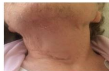
Figure 3: Inconspicuous scar after decanulation.

Depending on neck anatomy, duration of operation ranged from 5 to 17 min (average duration 11 \pm 2 min). An inconspicuous scar is observed after decanulation (Figure 3).