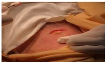
Figure 1A: Horizontal skin incision.

A 2-2.5 cm horizontal skin incision is made above 1.5 cm inferiorly of cricoids cartilage (Figure 1A).