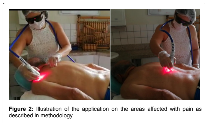
Figure 2: Illustration of the application on the areas affected with pain as described in methodology.

Table 1 shows the perception of the quality of life of the individual under study, evaluated by the Nottingham Health Profile (PSN) on issues faced on a daily basis. In the five categories, each item had a response, whose sum of YES, pre- and post-treatment, shows improvement in the quality of life perception, and can be related to reduction of muscle pain.