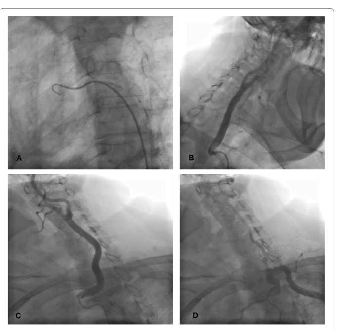
Figure 2: (A) Femoral S catheter in position with guidewire in the arcus aorta (B) Right carotid angiography, right lateral view (C) Left carotid angiography, left lateral view (D) Left subclavian artery angiography, left lateral view.