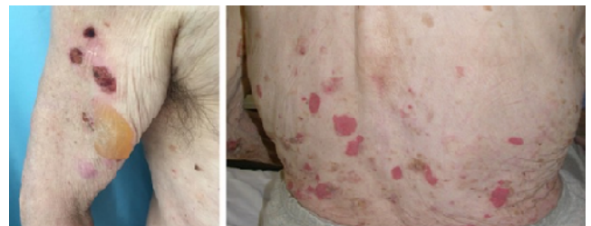
Figure 1: Polymorphous bullous eruption in course of nivolumab therapy for metastatic renal cancer.

A 73-year-old man presented with 2 months history of a bullous itching eruption. Physical examination demonstrated large erythematous-edematous bullous lesions, some with a clear serous content, some covered with serum-hematic crusts, on the trunk and arms (Figure 1); mucous membranes were unaffected.