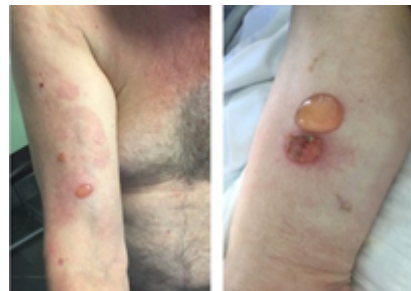
Figure 4: Bullous eruption relapse, 3 weeks after complete steroid dismissal.

Clinical, immunological and histopathological findings were diagnostic for bullous pemphigoid, and the patient started treatment with intravenous methylprednisolone 0.5 mg/Kg. in accordance with the oncologists, the decision to suspend nivolumab treatment was taken, and the eruption immediately improved (Figure 3). After 10 days, the skin lesions were completely healed, treatment passed to oral steroids and progressively tapered to 20 mg/daily. The oncologists decided to perform pulmonary metastasis ablation, and find unnecessary to reintroduce nivolumab. After 2 month of complete BP remission, the corticosteroid treatment was further tapered until complete dismissal. Unfortunately, 3 weeks from complete corticosteroids dismissal, severe itching announced the bullous eruption recurrence, requiring corticosteroid re-introduction (Figure 4).