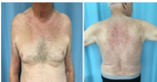
Figure 3: Rapid improvement after nivolumab dismissal and corticosteroid treatment.

Blood tests were performed with normal range results, except for the elevated serum BP180 antibody levels (171 U/mL; normal value <20). The following diagnostic work-up included a skin biopsy for routine histology and direct immunofluorescence, which confirmed the sub-epidermal blistering, with a prevalent lymphocyte exudate, and sparse eosinophils (Figure 2). Direct immunofluorescence showed linear deposition of IgG and C3c along the dermo-epidermal junction.