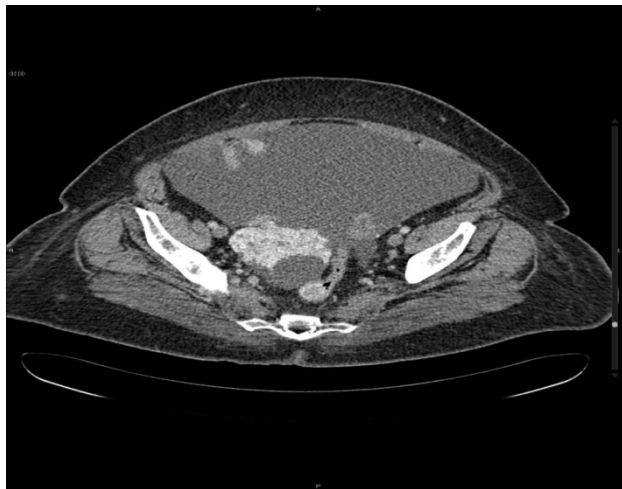
Figure 1: Abdominopelvic computed tomography showing a right adnexal mass 8 × 7 cm.

A 60-year-old woman, known case of hypertension and diabetes, presented with two months history of progressive shortness of breath and abdominal pain and distension without any improvement with diuretics. Computed Topography scan of her abdomen and pelvis contrast showed significant ascites in upper and lower abdomen, and showed a right adnexal mass measuring 8 × 7 cm with a 3 × 4 cyst and soft tissue component which is well-defined, having an irregular outline and heterogeneously intensely enhancing (Figure 1).