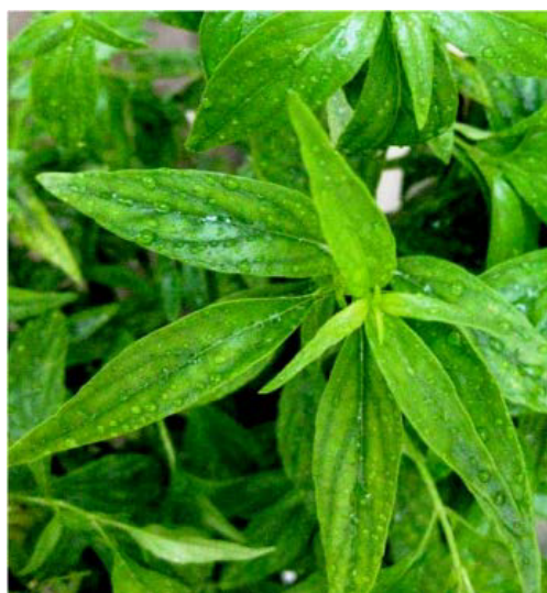
Figure 1: Andrographis paniculata (Burm. F.), a medicinal plant taxonomically classified as: Kingdom- Plantae; Order- Personales; Division- Angiosperma; Class- Dicotyledonae; Family- Acanthaceae; Genus- Andrographis , and Species- paniculata .

Andrographis paniculata (Burm. F.) Wall. Ex Nees (family Acanthaceae) also known as Kalmegh (Figure 1), is extremely bitter in taste and it is often referred to as the “the king of bitters”. This plant has been used as bitter tonic, stimulant, and aperients in Ayurvedic and other traditionally known health care systems widely practiced in India and other Asiatic countries. Amongst numerous plants of the Andrographis genus, Andrographis paniculata is the only one widely used for medicinal purposes, and it is also pre-clinically and clinically the most well studied one. Andrographolide (Figure 2) is quantitatively the major bioactive secondary metabolite of the plant [1], and it is now often considered to be a structurally and functionally novel therapeutic lead potentially useful for treatments for inflammatory diseases and cancer [2-9]. However, diverse types of medicinally used Andrographis paniculata extracts contain other structurally analogous labdane diterpenoids, oxygenated flavonoids, and numerous other bioactive secondary plant metabolites. Some of the major medical conditions commonly treated with such extracts is diabetes, liver disorders, common cold, dyspepsia and other diseases of the gastrointestinal