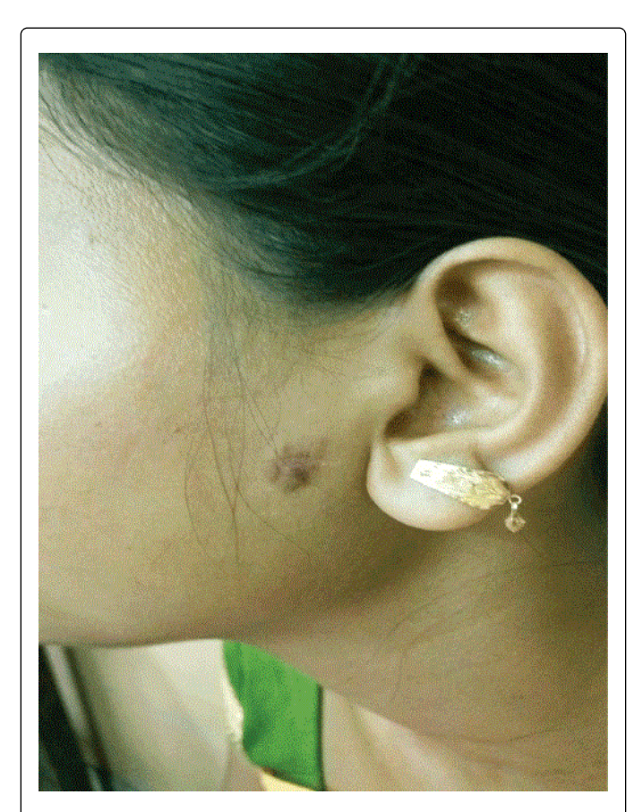
Figure 1: Shows swelling in the preauricular area at the time of presentation.

A 27 year old female patient attended our ENT outdoor with a mass in the left preauricular area for last 1 year. The swelling was insidious in onset and gradual on progession. On inspection the swelling was smooth surfaced with well-defined margin having dimension of 1.5 cm*1 cm. On palpation it was stony hard and free from skin and underlying structures. On ultrasonography it showed an ovoid mass with 1.2*0.8 cm dimension at the junction of dermis and subcutaneous fat having well defined margin, heterogenous echotexture, hypoechoic rim and calcification. There was no cervical lymph node enlargement or facial muscle weakness. Excision biopsy was planned under local anaesthesia. Macroscopically it was a grayish mass with 1.2*0.8*0.5 cm dimension. Histopathology report revealed multiple islands of epithelial cells composed mainly of eosinophilic shadow cells, which are pathognomonic for pilomatrixoma (Figures 1 and 2).