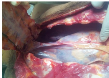
Figure 5: Dissection of the neck and chest.

Evidence of any cardiopulmonary pathology was ruled out from gross and microscopic histopathological examination. Layer-wise and careful dissection of the neck and chest did not reveal any evidence of pneumomediastinum (Figure 5), CSTE (Figure 6) or air bubbles around mark of strangulation (Figure 7).