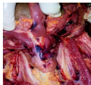
Figure 6: Cervical soft tissue emphysema.